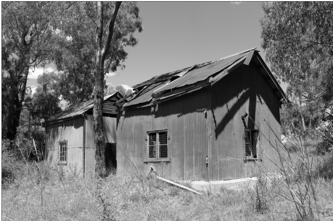
Merrygoen Water Supply Pump and Housing